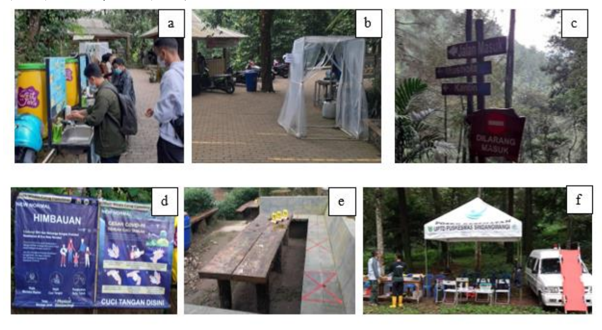
Figure 3 Structural mitigation in Curug Cipeteuy, (a) hand-wash sinks, (b) sterilizer chamber, (c) sign route, (d) preventative measures instructions, (e) physical distancing signs, (f) health care services

We observed that Curug Cipeteuy had provided hand-wash sinks, a sterilizer chamber, and physical distancing signs. To make sure that visitors are clean and hygienic, they must wash their hands and enter the sterilizer chamber before getting into the tourism site. These measures might be related that needles are believed to be an effective media in transmitting COVID-19 viruses. More importantly, Orîndaru et al. (2021) suggest that enhancing clean and hygiene conditions would restore visitors' confidence in visiting a tourist destination. Furthermore, physical distancing signs and preventative measures instructions were deployed scattered in the tourism area, warning visitors to wear masks, keep their distance and stay away from the crowd. Moreover, a separate line to enter and exit the tourism site was built to lessen the crowd. More importantly, they also prepare health services for visitors, including body temperature measurement, disinfectant sprays, and immediate health care in need. Figure 3 shows structural mitigation strategies implemented in Curug Cipeteuy.