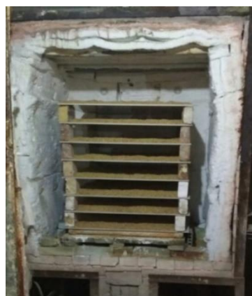
Figure 4. Medium scale furnace capacity 15 kg rice husk

Ashing of rice husks is carried out in a medium-scale furnace with a furnace capacity of 15 kg. Rice husks were burned at a heating rate of 1.5°C /minute to 900 °C, in the process of burning rice husks, holding at a temperature of 400°C and 900°C for 1 hour.