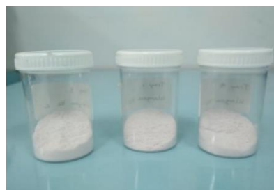
Figure 5. Silica from rice hus

Rice husk ash was washed using technical 3% hydrochloric acid (HCl). The washing process is aimed at reducing the existing impurity to obtain silica husk ash. The washing process husk ash using HCl 3% technical (ie 12 mL of HCl 3% technical for 1 g husk ash), then heated over a hotplate at a temperature of 200 °C and stirred using a magnetic stirrer (magnetic stirrer) at a speed of 240 rpm for 2 hours. Then washed using hot distilled water repeatedly until free of acid (tested using litmus paper), then filtered with ash-free filter paper. The filtered result is heated in a furnace at a temperature of 1 000 °C until the remaining white silica. The samples were cooled in the furnace (furnace temperature labored together at room temperature). Silica final product produced from rice husk is shown in Figure 5.