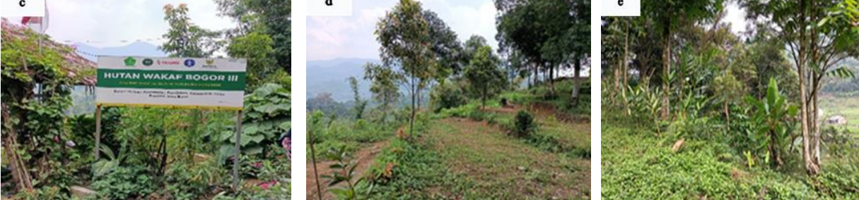
Figure 2 (a) Bogor Waqf Forest I, (b) Bogor Waqf Forest II, (c) Bogor Waqf Forest III, (d) Bogor Waqf Forest IV, and (e) Bogor Waqf Forest V