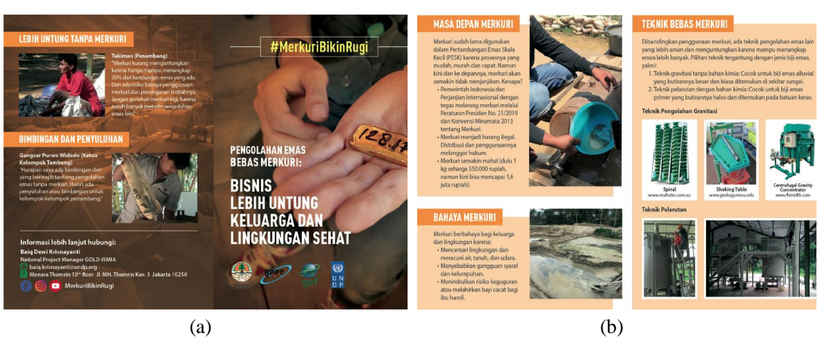
Figure 2 (a) leaflet front page and (b) back page

The leaflets contain information on the future of mercury, the dangers of mercury to families and the environment, mercury-free gold processing techniques, and the advantages of mercury-free gold processing. Provided in Figure 2a and 2b are the leaflets.