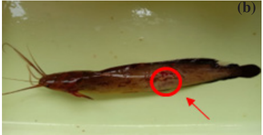
Figure 1. Infected kerandang fish (a) and infected catfish (b).