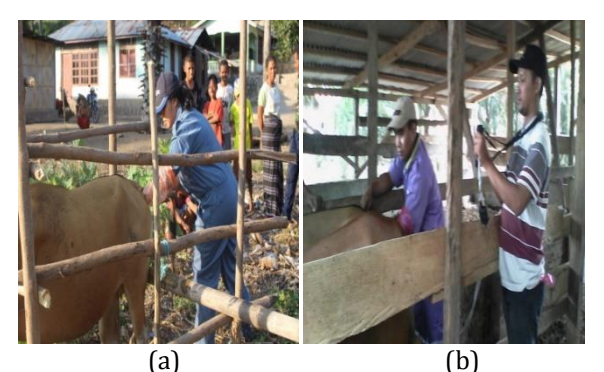
Figure 1. (a) Rectal palpation; (b) Ultrasonography of Bali cattle

The histology of the uterus can be determined by its echotexture appearance as the submucosa can be visualized as an anechoic beneath endometrium. As we found in, most of the farmers in Maumere are lack of information about the importance of knowing about early pregnancy detection in Bali cows, while early pregnancy diagnosis is crucial in determining fertility status of the herd. An early pregnancy diagnosis facilitates the detection of non-pregnant cows and enables them to be naturally mated by rotating system as many non-pregnant cows do not show heat or the heat is not detected by the farmer.