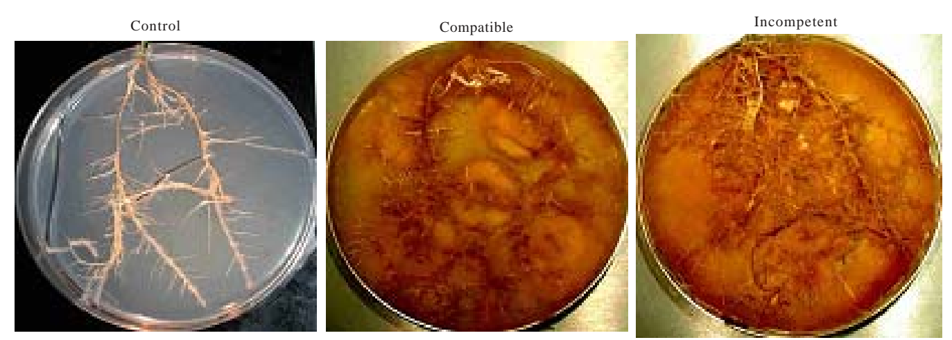
Figure 1. Root systems of poplar in control plant (left) and plants inoculated with compatible MAJ (middle) and incompetent NAU (right) P. involutus isolates.

Morphological and Anatomical Characteristics. Root tips morphological changes of compatible association characteristics of mycorrhizal formation were visible one week after inoculation. The mycorrhiza continued to develop and they were mature by five to seven weeks. Development of poplar both grown in the absence and presence of P. involutus under currently described Petri dish system occurred normally.