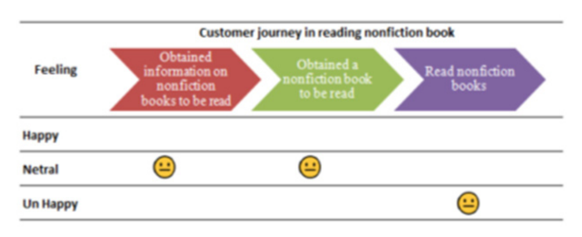
Figure 2. Customer feeling journey

Customer journey map were used to remap the information obtained from empathy map canvas in order to customer journey could be mapped clearly. The customer journey map has there stages that the customer will go through defined from empathy map - "what they do?" section as followed (1) Obtained information on nonfiction books to be read; (2) Obtained a nonfiction book to be read; (3) Read nonfiction books. The study found the customer feelings through the journey of reading nonfiction books that customer was not happy when reading book on the smart phone, and normal feeling for stage obtained information nonfiction book and stage obtained a nonfiction book. The customer feeling journey shown in Figure 2. The problems explanation of customer journey in each stage followed as activities, customer problem, and customer expectation shown in Table 1.