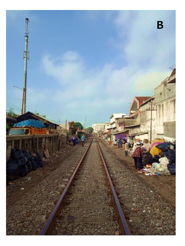
Figure 1 The study area, in Blimbing sub-district, Malang City, East Java showing the study sites circled in red (A) and the local community lives in landfills area around the railroad (B).

head and underbody, fleas, and lice usually predilection on the lower part of the abdomen, and underbody. For chigger mites usually in the ears part. Any ectoparasites were placed in a vessel tube containing 70% alcohol. Each tube was used for each rodent and labeling. After that, removed ectoparasites for processing used alcohol fixation increase concentration, clearing with xylene, and mounting on microscope slides for identification with standard protocols (Herbreteau et al. , 2011; Paramasvaran et al. , 2009).