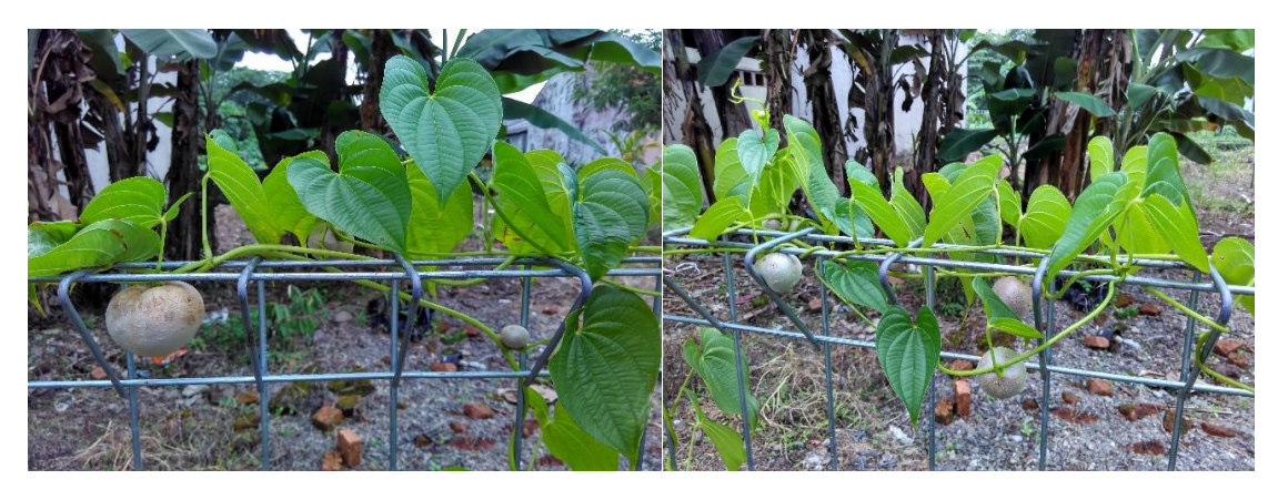
Figure 1 Gembolo plant morphology.