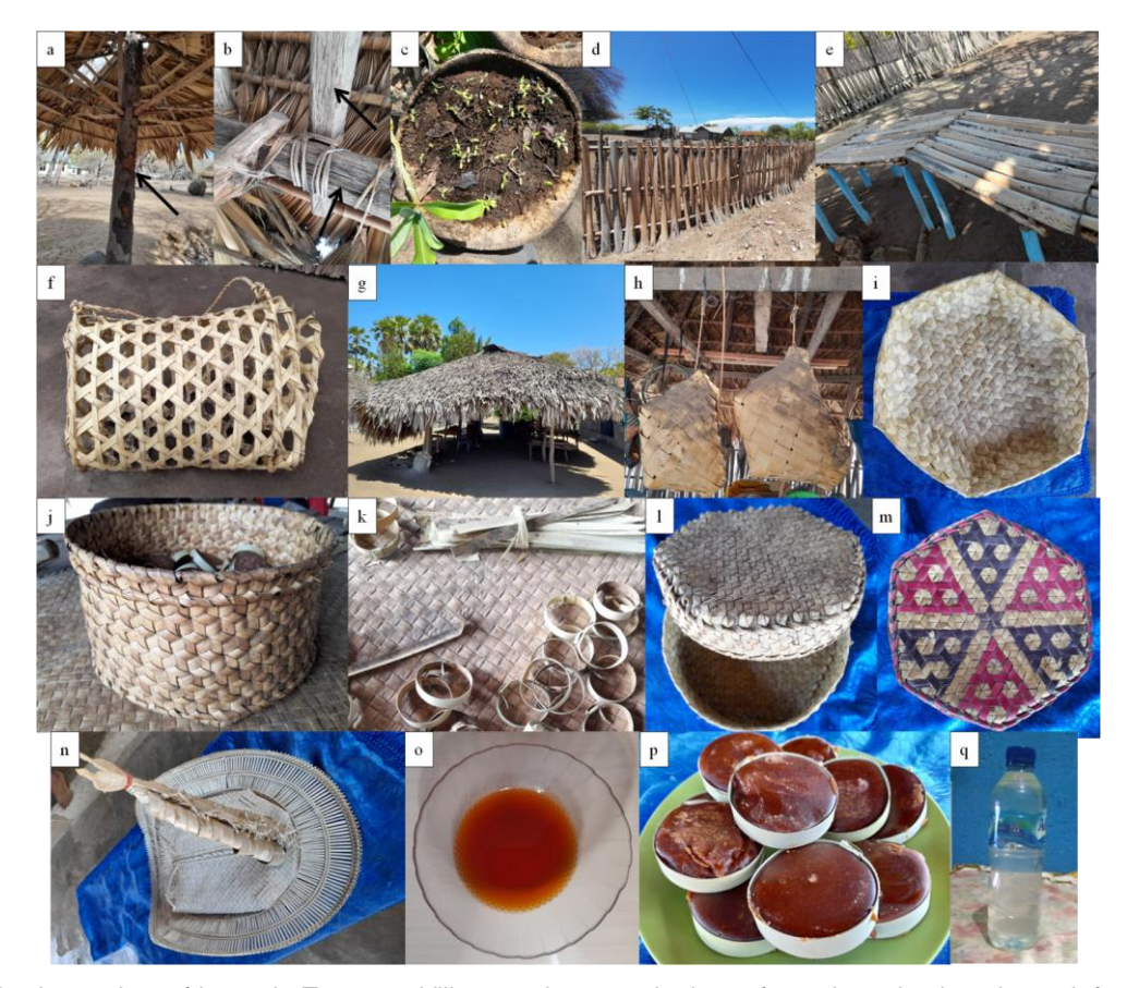
Figure 1 Utilization variety of lontar in Tuamese Village. a. house pole; b. roof wood; c. planting place; d. fence; e. seat; f. chicken basket; g. roof; h. food container; i. winnowing tool; j. small basket; k. slab sugar mold; l. betel nut container; m. material container; n. traditional hat; o. liquid sugar; p. slab sugar; q. traditional fermented drink (sopi)