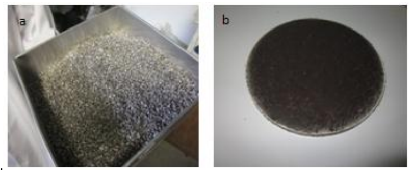
Figure 4 Results of extrusion (a) and compression (b)

As a result of the fibrous structure and strong hydrogen bonds. Cellulose has a high tensile strength. Thereby. greater the higher the cellulose content of the fiber tensile strength. Fiber-reinforced composites rattan bark and kenaf fibers exhibit high tensile strength compared with acacia fiber. coconut fiber. Because the cellulose fiber content of rattan is also high ranging between 37-44% and 45-60% ranges kenaf fiber (Table 3).